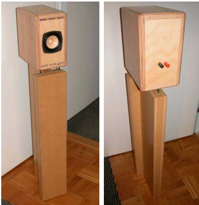
The finished products on their sand-filled stands.

I have a love and hate relationship with these speakers. When playing an intimate jazz trio, a Beethoven string quartet or solo vocals you nearly fall off your chair with amazement. Such openness, neutrality and an amazing sound stage with immense depth and width. Every thing can be pin-pointed in the virtual soundscape, every little sound, the turning of a page of sheet music, the breathing of the instrumentalists, its all there. But as soon as it gets a bit heavy (large orchestral works or complex jazz-rock) everything gets muddled up. Here the shortcomings of small cone area, minute Xmax and a single cone trying to produce bass and treble at the same time show. What it also misses is (deep) bass – the addition of a small sub-woofer could help a lot here. When they have support from a rear wall the lower end becomes more in balance with the rest. Of course you can't expect ultra low bass orgies but the music does have enough body to it. Okay, it doesn't have the extreme top-end clarity of a good tweeter or the deep bass of a nice large woofer but if you can live with that you will be amazed! For intimate proximity listening of small combo's, you can't get much better than this considering how cheap the speaker is.