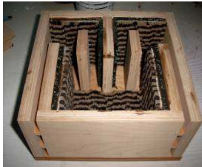
The cabinet and the damping material.