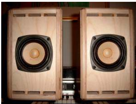
That's a nice pair!

The Fostex FE103 (a.k.a. ACR FE103). A not very expensive 100mm (4 in) non-coated paper cone type full range driver. It uses a simple stamped steel chassis holding a lightweight short voice coil moving assembly. The moving mass is only 2,7 grams! Frequency response is up to 18kHz, which is high enough for a single driver speaker. Sensitivity is rated at 89dB at 1W/1m. Continuous power rating is only 5 watts but you will be surprised how loud 5 watts can be. Resonance frequency f_s is 80Hz and X_{max} is only 0,35mm so don't expect thunderous deep bass and high SPL's from these little chaps.